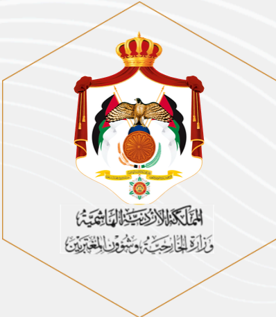
Ministry of Foreign Affairs and Expatriates